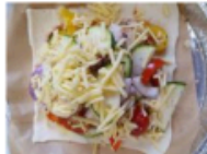
Before cooking – Vegetable Tarts