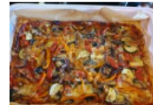
After Cooking - Vegetable Tart

Polite reminder Please can parents return any After School Club cooking containers so that we can reuse them. Many thanks