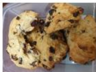
Cranberry and Sultana Rock Cakes

After School Club this week have made some very tasty Cranberry and Sultana Rock Cakes. We even shared some with the Governors! We also made some planters out of recycled milk cartons, which we decorated with sharpies and then planted with either Teddy Bear Sunflowers, Petite Pois or Radish.