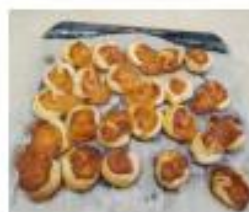
Cheese and Tomato pinwheels