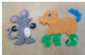
Hama Bead Creations

Last week we had great fun with a favourite activity, Hama beads. I am always impressed by the beautiful creative designs that the children come up with. We sat creating our designs with mindful music playing in the background and children happily helping each other find the colours they needed and sharing interesting colours and shiny glittery Hama Beads with each other. We also enjoyed baking Cheese and Tomato Pinwheels and Apple Crumbles.