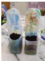
Recycled Milk Bottle Planters