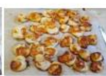
Cheese & Tomato Pinwheels