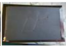
Constellations Light Boxes