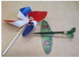
Spitfire and Windmill

After School Club have made some amazing Spitfires and attempted to make Lancaster Bombers (but sadly failed) this week in honour of VE Day and Union Jack Windmills. We also made a wartime recipe for Fruit Crumble, which was actually very tasty.