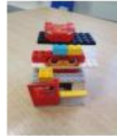
One of our many Lego Creations

Polite reminder Please can parents return any After School Club cooking containers so that we can reuse them. Many thanks