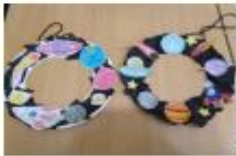
Spaced Themed Hangers

Last week we celebrated National Space Day (1 st May). We made Space themed hangers and Star Constellation Light Boxes. We made these by taking a lidded, cellophane topped box, which we added small LED lights too. Then we drew different star constellations on to black card and punched holes in the card to show the stars. They looked very effective, although it wasn't dark enough in school to truly get the full effect. We enjoyed baking Cheese and Tomato Pinwheels and Cranberry and Sultana Rock Cakes too.