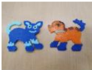
Hama Bead Creations