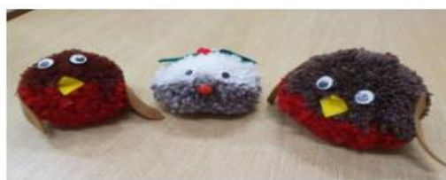
Robin and Christmas Pud Pom Poms

This is what we are planning to do next week and the first week back after Christmas: