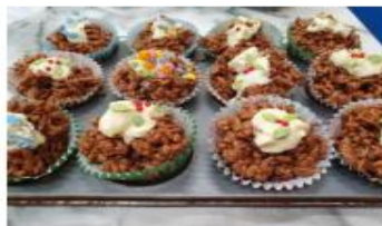
Chocolate Crispy Puddings