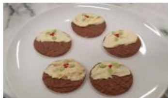
Chocolate Christmas Pud Biscuits

I can't believe another fortnight has slipped by; they say time flies when you are having fun and we have certainly been having fun in After School Club. We have been concentrating on all things Christmassy. We made some lovely Chocolate Crispy Puddings, Chocolate Christmas Pudding Biscuits and fluffy Robin and Christmas Pudding pom pom decorations. Next week before we break up we are making Mince pie Swirls, Baubles and Hama Bead decorations.