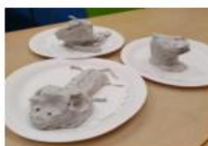
Air Dry Clay Creations

Polite reminder Please can parents return any After School Club cooking containers so that we can reuse them. Many thanks