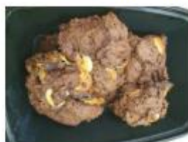
Chocolate Rock Cakes

One of the childrens favourite activities is Lego. They are amazing at making all sorts of vehicles, houses, animals and people etc. Below are photos of two of the most recent makes.