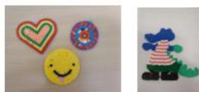
Hama Bead Creations

After school club is open Monday to Friday 3.10 to 6pm. We offer two session choices: Option 1 from 3.10 to 4.30pm (£6.00) and Option 2 from 3.10 to 6pm (£12.50). After 4.30pm we do activities, such as cooking and craft. Don't forget to book via Scopay or the school office.