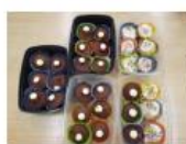
Chocolate / Confetti Cakes

This week we have made Chocolate and Confetti cakes and more Hama bead creations. (Hama beads is a popular activity in After School Club.)