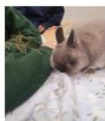
Cranberry the Netherland Dwarf Rabbit having cuddles and playing in his playpen.

I also brought in one of my rabbits called 'Cranberry'. The children really enjoyed the experience especially having time stroking and cuddling him.