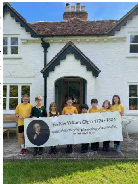
The pupil history group at Gilpin's Cottage (the site of the original school)

There is lots going on as part of the #Gilpin300 celebrations, both here at school and in the local community. Pupils have taken home flyers today with all of this information, which is also summarised below: