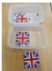
Hama bead Union Jacks