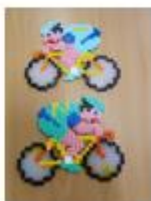
Hama Bead Cyclists

In After School Club we have been busy working on some of the elements needed for our 'Olympics' in a tray entry for the Boldre Produce show on the 13 th July. We have made some cyclists and Union Jack flags for our entry so far out of Hama beads. We will continue to work on our entries over the next two weeks.